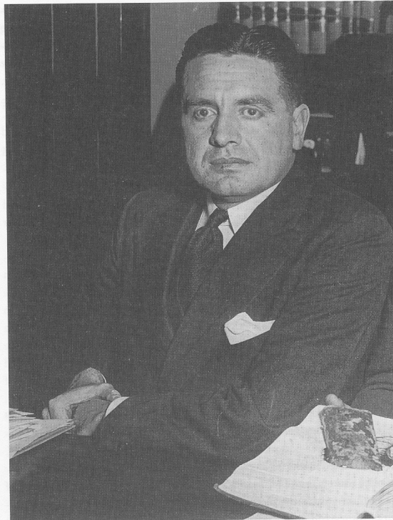
Harry Anslinger in his heyday as commissioner of the Federal Bureau of Narcotics. To his left is a hollowed-out book used to smuggle drugs.